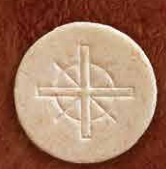
11/2" (38mm) - Whole Wheat

11/2" (38mm) Special - Whole Wheat These breads are more wheaten and have three different incised designs which have a significance for one receiving in the hand.