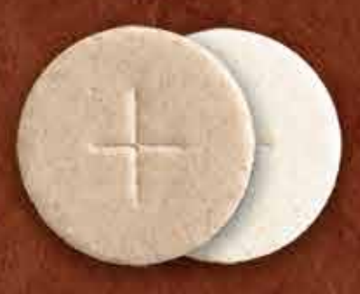
13/8" (35mm) Whole Wheat & White Also available with Lamb design.