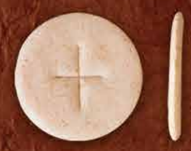
13/8" (35mm) - Double Thíck Whole Wheat Double the thickness of most breads.