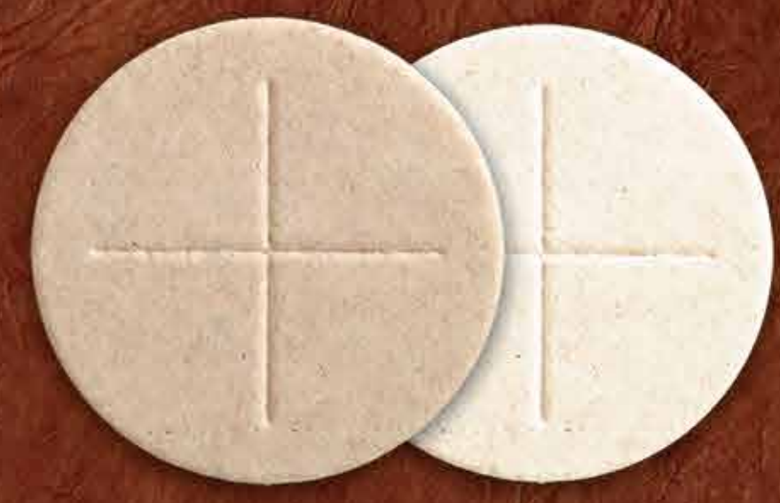
23/4" (70mm) Large Whole Wheat & White