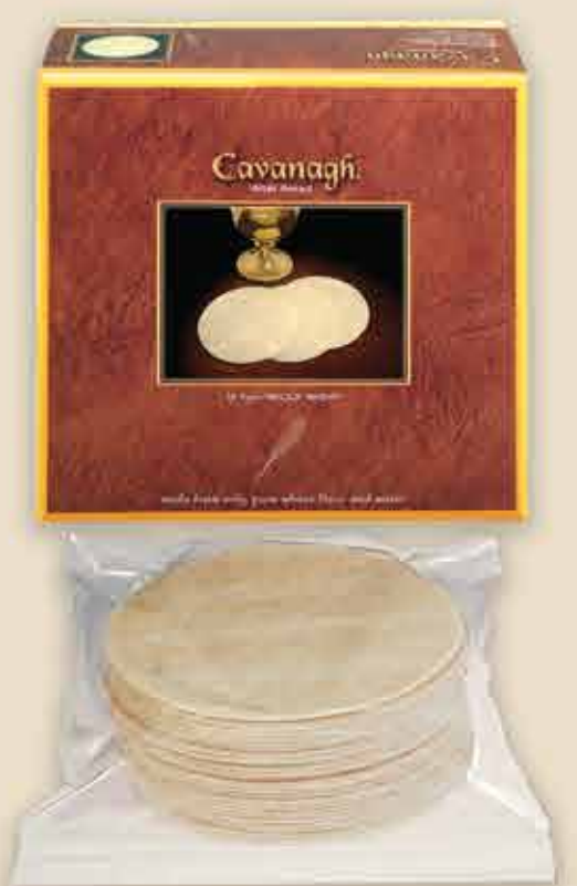
53/4" Whole Wheat 9" Double Thick - Whole Wheat