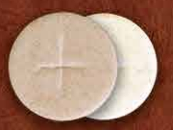
11/8" (29mm) Whole Wheat & White