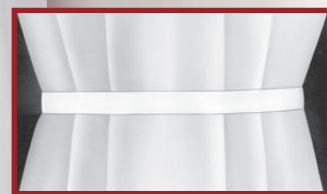
Back Detail 425