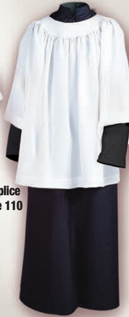
Surplice style 110