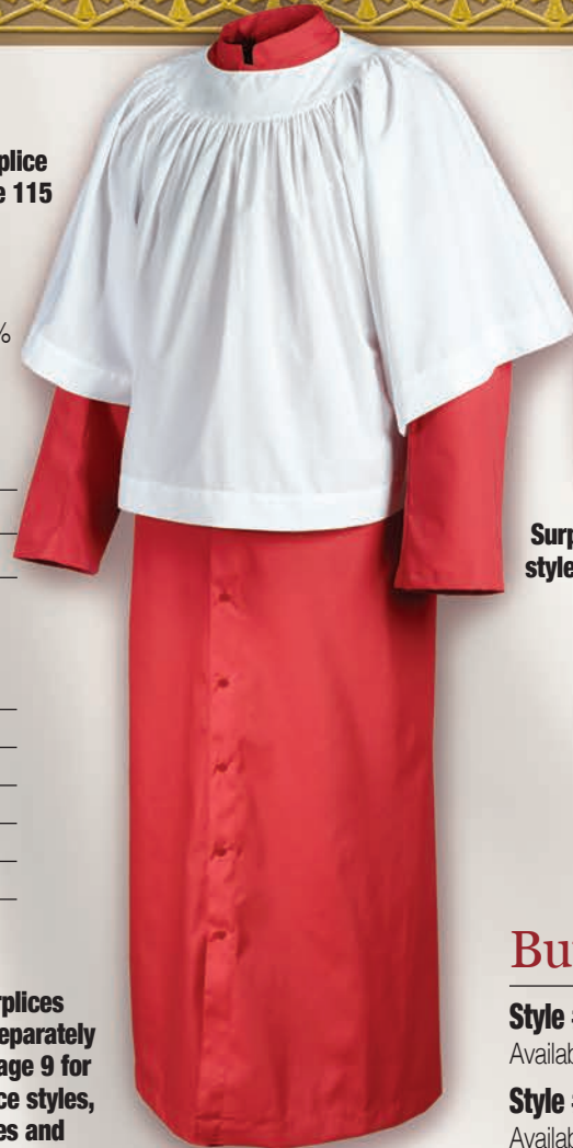
Surplice style 110