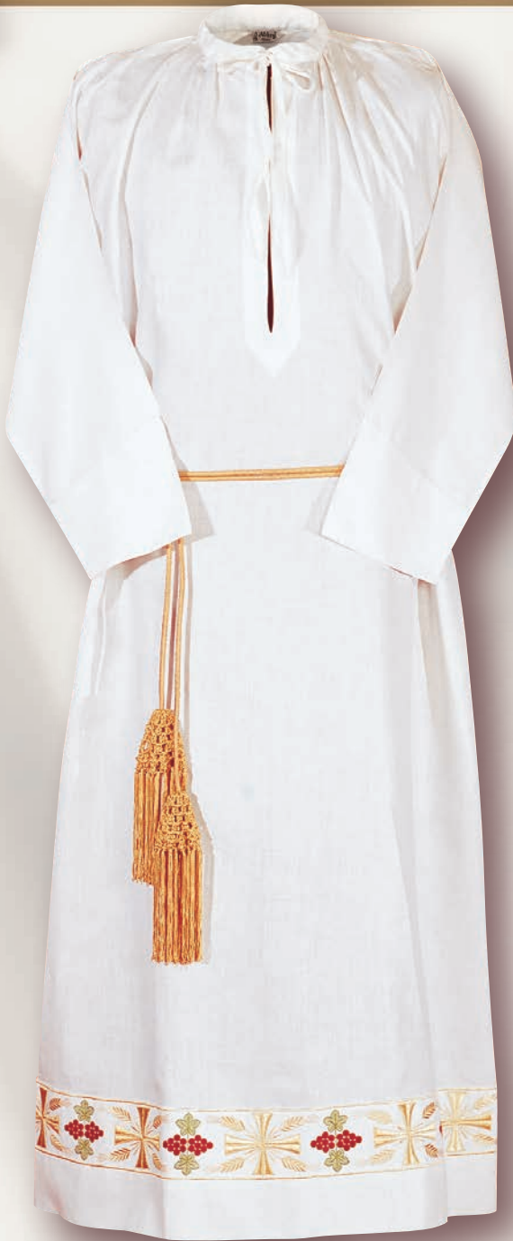
Garment style 55 with Banding style 1878 – No.55-1878