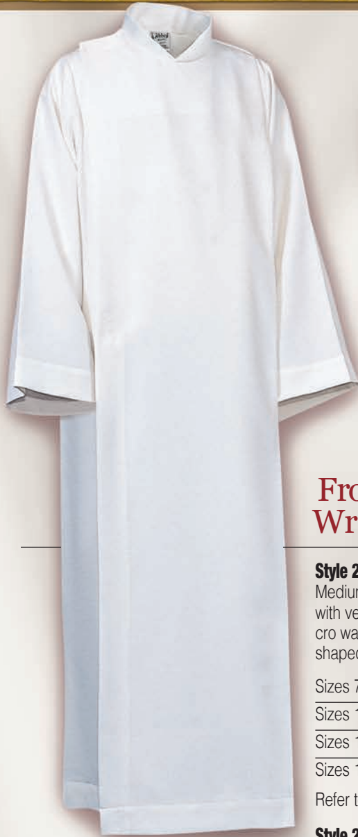
Style 225 Style 226